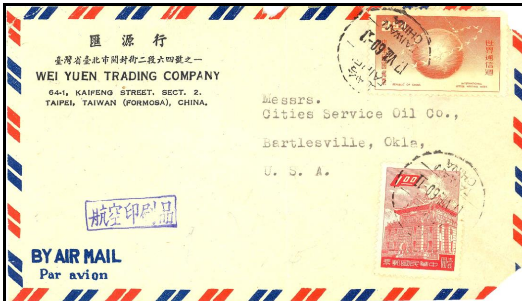
Figure 4, "A" international mail cancel