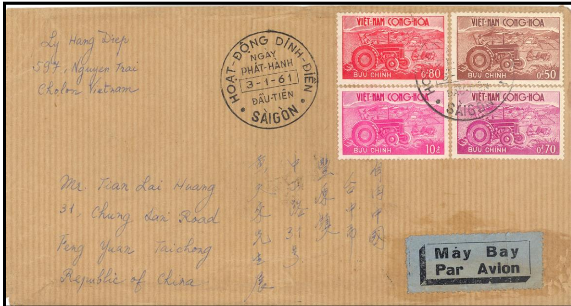
Figure 1, cover from Saigon to Taiwan